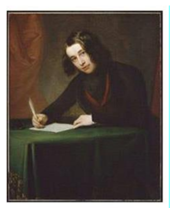
Charles Dickens (1842)